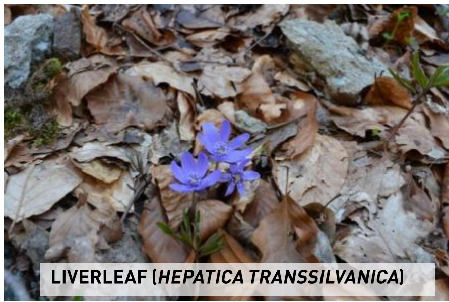
LIVERLEAF ( HEPATICA TRANSSILVANICA )