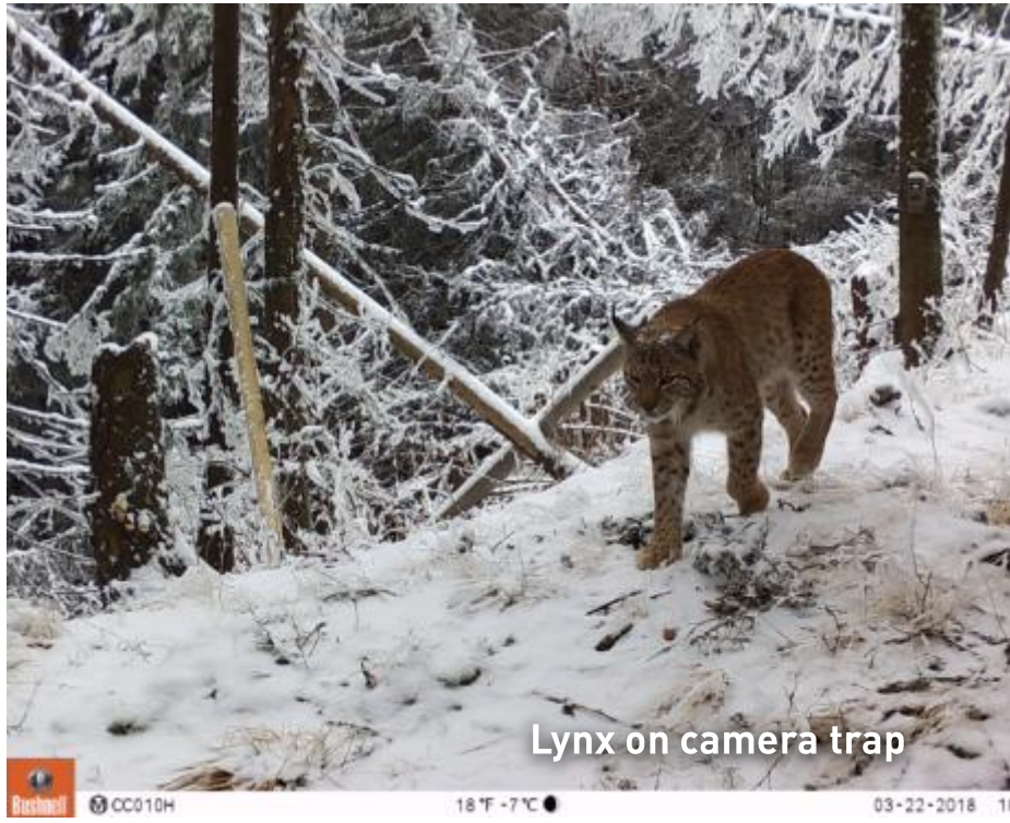
Lynx on camera trap