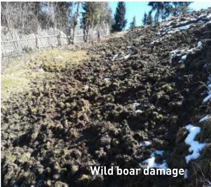
Wild boar damage