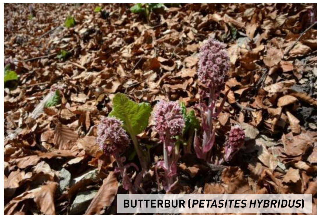
BUTTERBUR ( PETASITES HYBRIDUS )