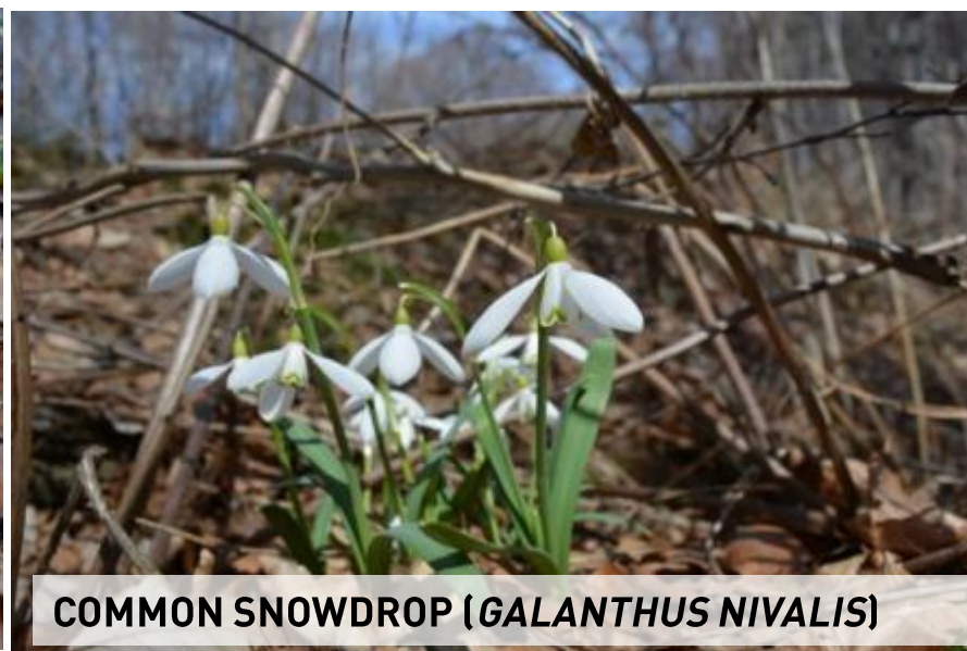
COMMON SNOWDROP ( GALANTHUS NIVALIS )