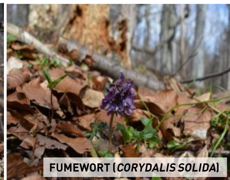
FUMEWORT ( CORYDALIS SOLIDA )