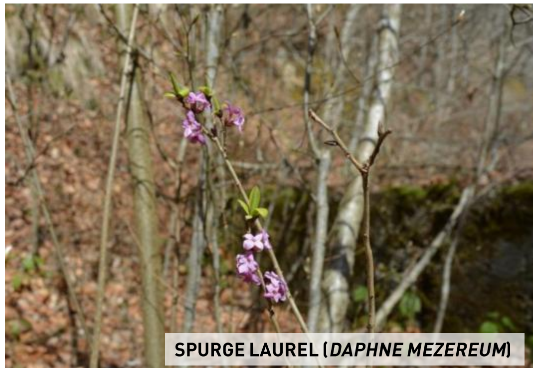
SPURGE LAUREL ( DAPHNE MEZEREUM )