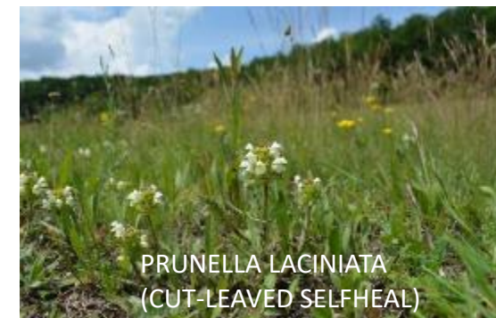
PRUNELLA LACINIATA (CUT-LEAVED SELFHEAL)