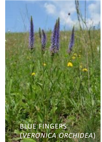
BLUE FINGERS ( VERONICA ORCHIDEA )