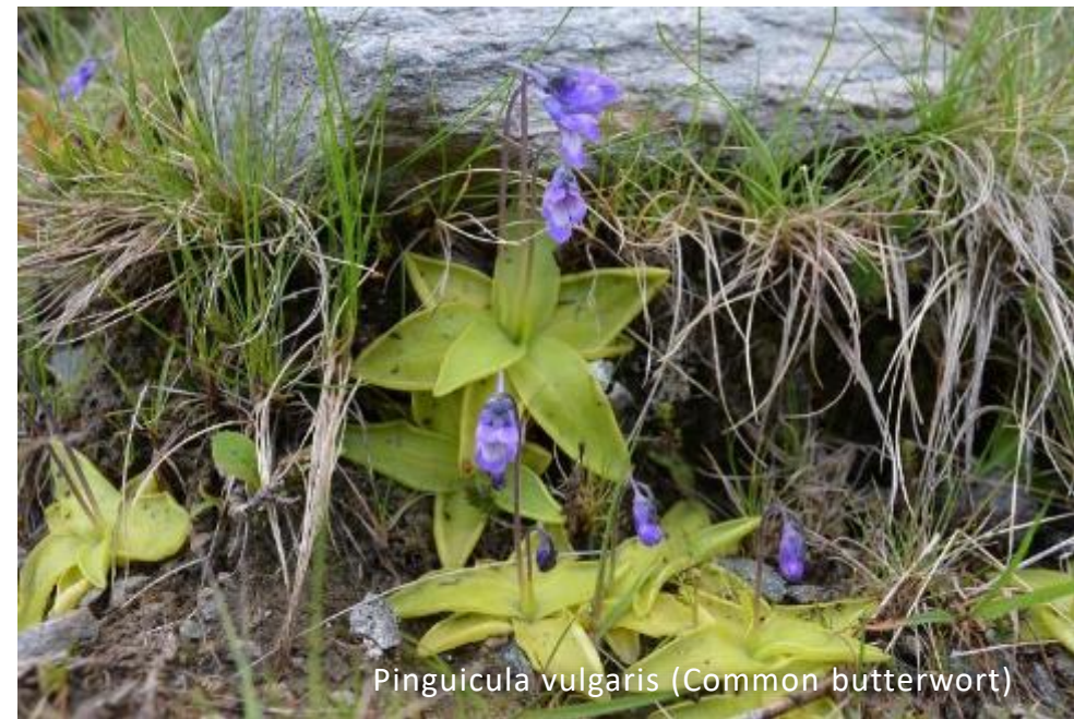
Pinguicula vulgaris (Common butterwort)