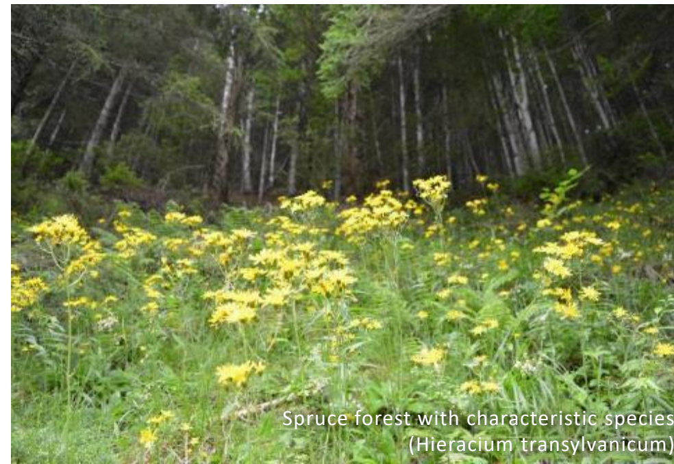
Spruce forest with characteristic species ( Hieracium transylvanicum )