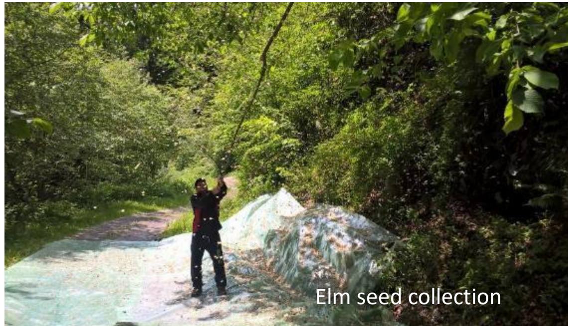
Elm seed collection