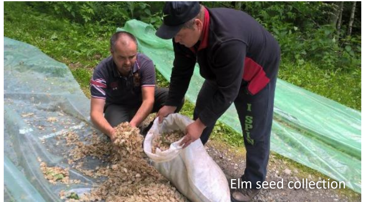
Elm seed collection