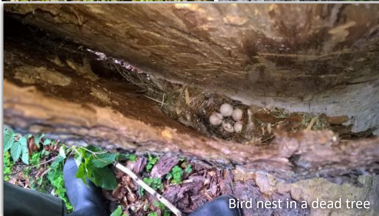
Bird nest in a dead tree