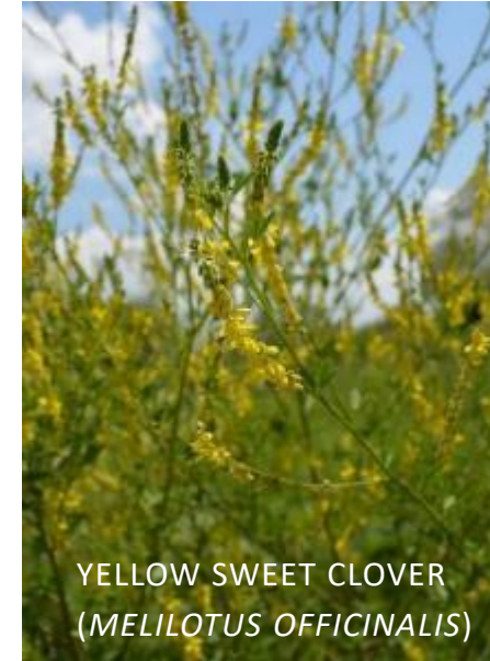
YELLOW SWEET CLOVER ( MELILOTUS OFFICINALIS )